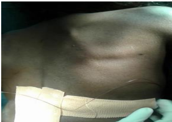
Fig 2: Showing Final fixation of Catheter to side of chest.

Patient had pain free period of 10-12 hours following the top-up. The VAS scores were 2 after the Top up. The top up was repeated every 10-12 hours to a max dosage of not more than 200 micrograms/24 hours. She was able to ambulate well and carry on her routine activities. The catheter fixation site was checked for any signs of inflammation or infection. Everyday dressing was done with betadine ointment. The catheter was removed on the 11th postoperative day of insertion and was sent for culture. It was deemed free of any pathogens after 3 days.