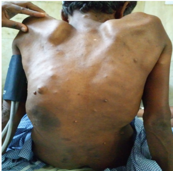
Fig 1: Showing the spine with deformity

conscious, co-operative, oriented, moderately built and nourished. His pulse was 74/min, BP118/60 mmHg and on examination patient had swelling in perianal region with pain in the perineum and mild fever. Airway was Mallampatti grade 2. He had severe thoracolumbar Kyphoscoliosis (Fig.1). Patient had no significant history of any medical illness like tuberculosis or polio.