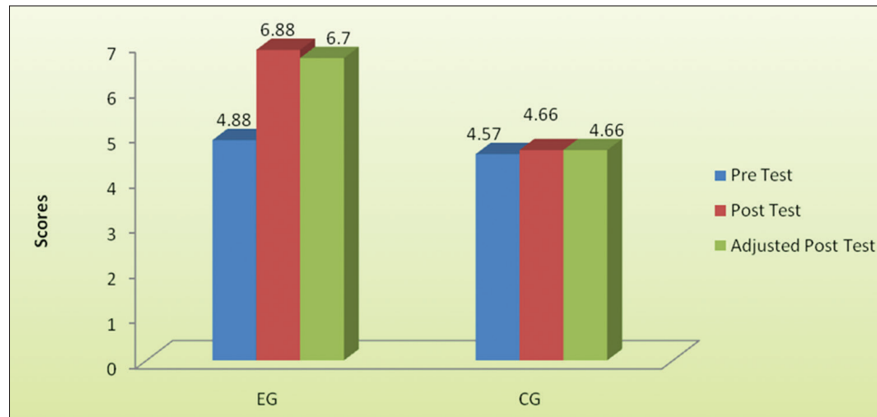
Figure 2: Comparisons of pre-test means, post-test means, and adjusted post-test means for control group and experimental group in relation to hitting

present study have strongly indicates that circuit training of 12 weeks have significant effect on selected performance variables, i.e., dribbling and hitting of hockey players. Hence, the hypothesis earlier set that circuit training program would have been significant effect on selected performance variables in light of the same the hypothesis was accepted.